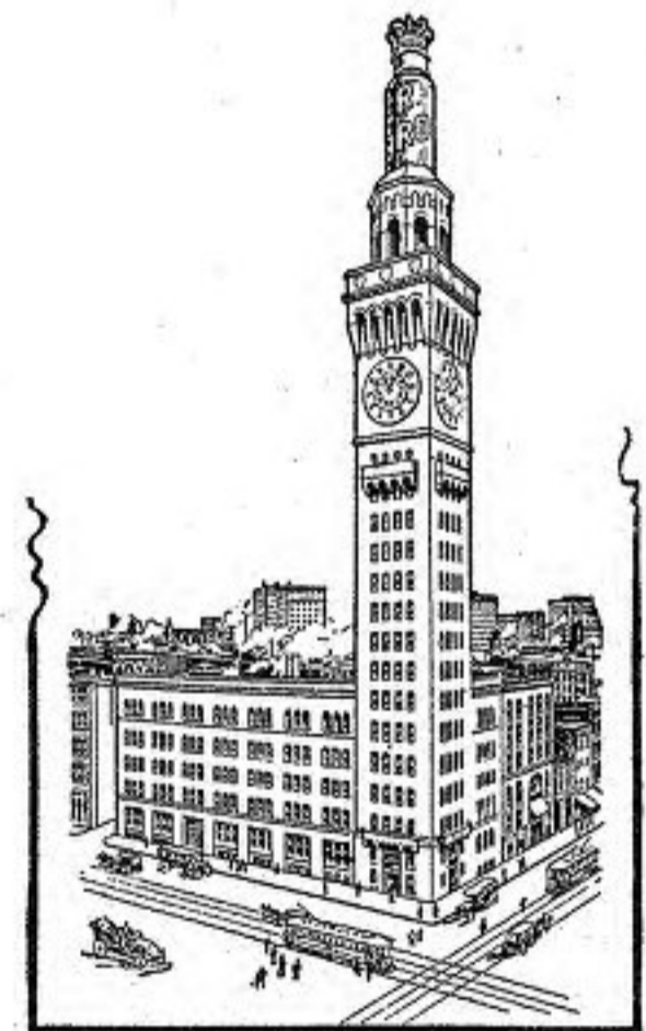
BROMO-SELTZER TOWER BUILDING, BALTIMORE.